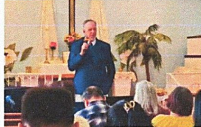
TIME OF SHARING