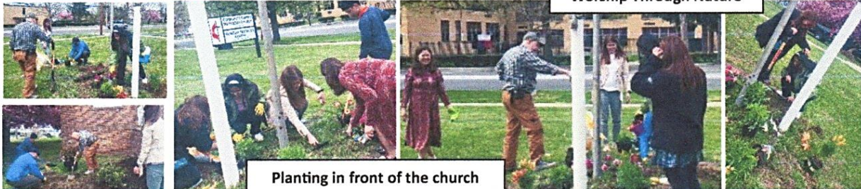
Planting in front of the church