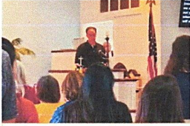
READING OF THE SCRIPTURE