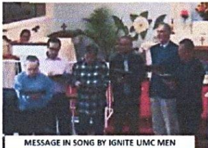
MESSAGE IN SONG BY IGNITE UMC MEN