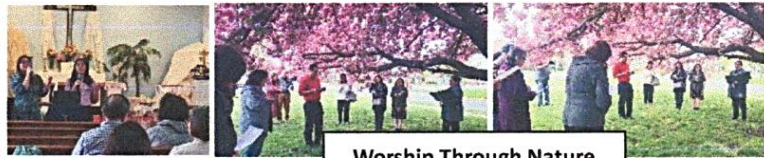
Worship Through Nature