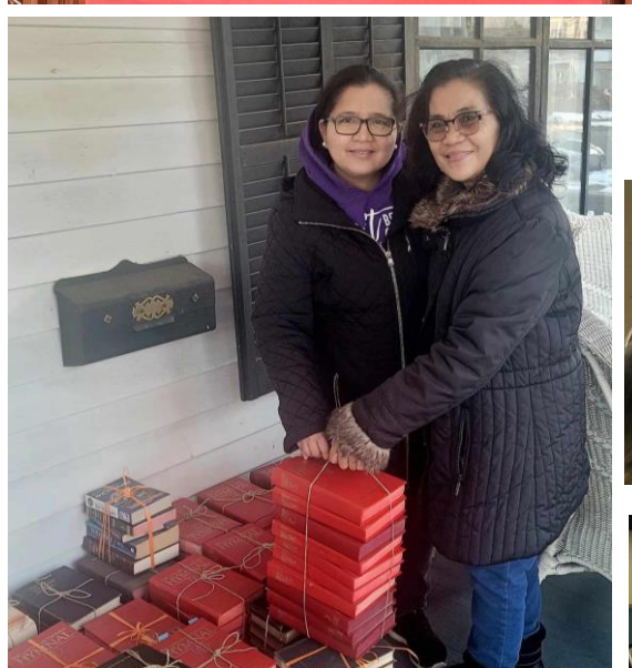
Hymnals and Bibles donated to Kingsway Philippines International