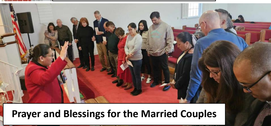
Prayer and Blessings for the Married Couples