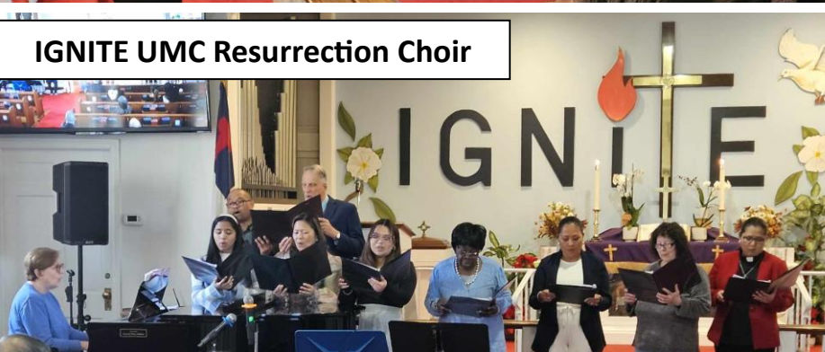
IGNITE UMC Resurrection Choir