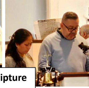
Couples – Reading the Scripture