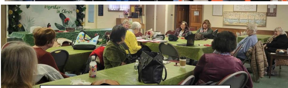
Women's once a month Fellowship