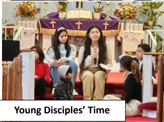
Young Disciples' Time